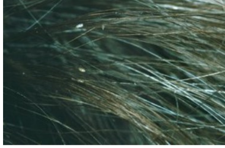
Head lice eggs (nits) are brown or white (empty shells) and attached to the hair.