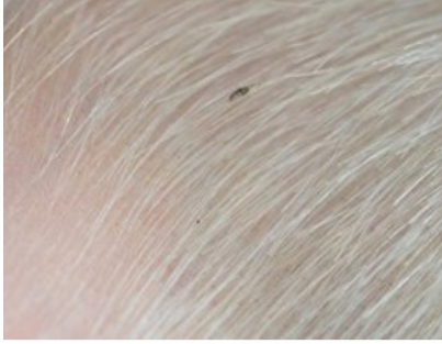
Head lice are small insects, up to 3mm long.

Head lice and nits are very common in young children and their families. They do not have anything to do with dirty hair and are picked up by head-to-head contact. They are easily spread in schools, but everyone working together using the combing method described below at the same time can help eliminate them.