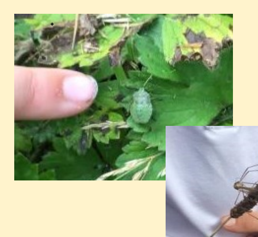
...And bugs and all sorts of natural treasures!