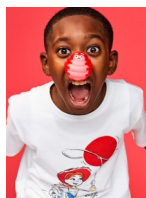
Comic Relief—Friday 19th March

There is so much organisation that goes into providing a full broad educational experience for our children and helping young people achieve their full potential. Ladock & Veryan C of E Schools strive, continuously, to provide the best opportunity for our children to succeed whilst helping them grow into responsible and caring individuals. I hope my contribution helps to support this effort.