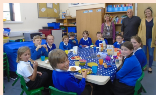
Big Brain Breakfast

Well done to our Year 6 children this week—you have worked so hard and tackled each day of SATs testing with a fantastic and mature attitude. You should be very proud of what you have achieved and we look forward to celebrating with some relaxing fun days!