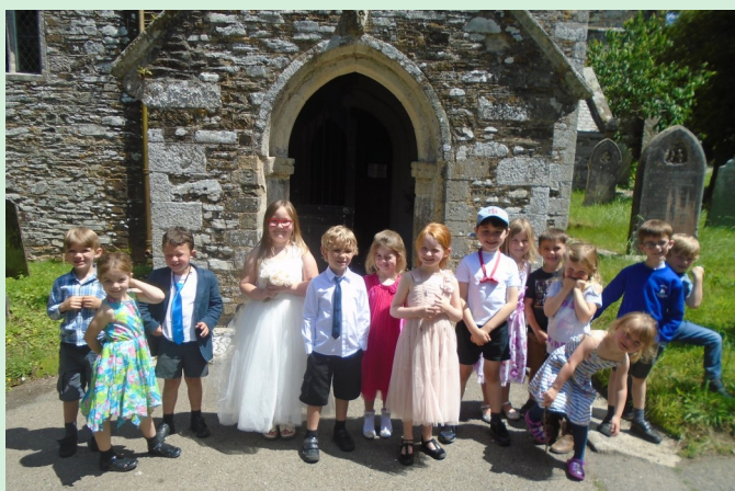
The happy couple & guests at the church