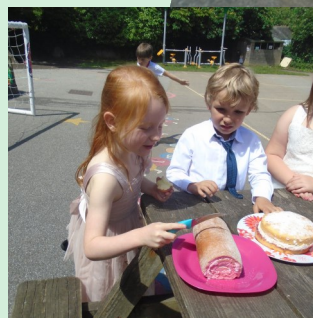
Cutting the cake and the couple's first dance.