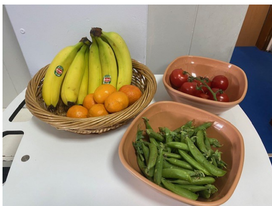
Healthy snacks are always available to the children